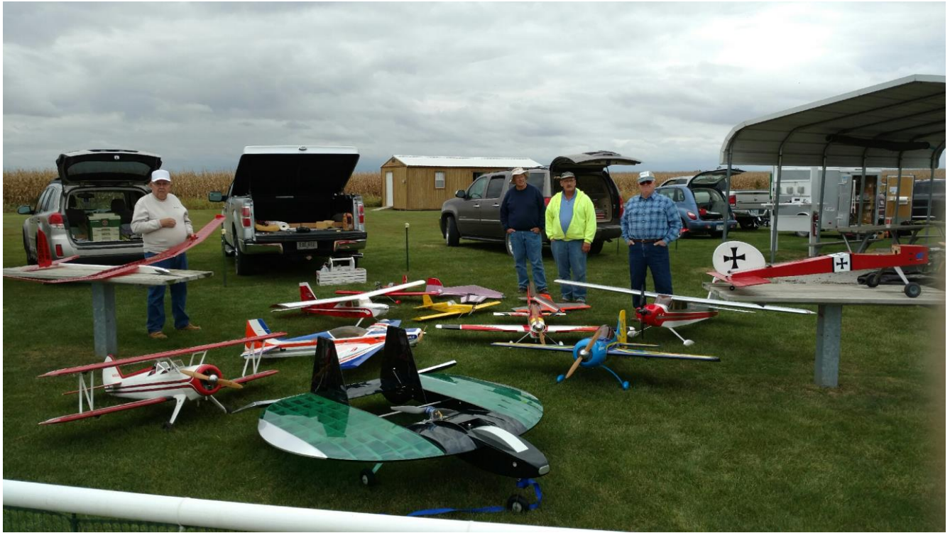
Your Biggest Plane Day at West Field