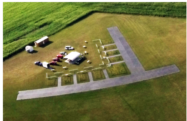
West Field's new building

One quick note and heads up... Preflight? How many of us do a preflight on our planes/helis? Just stopping and taking just a few minutes to check over your aircraft could save you from a bad day at the field.