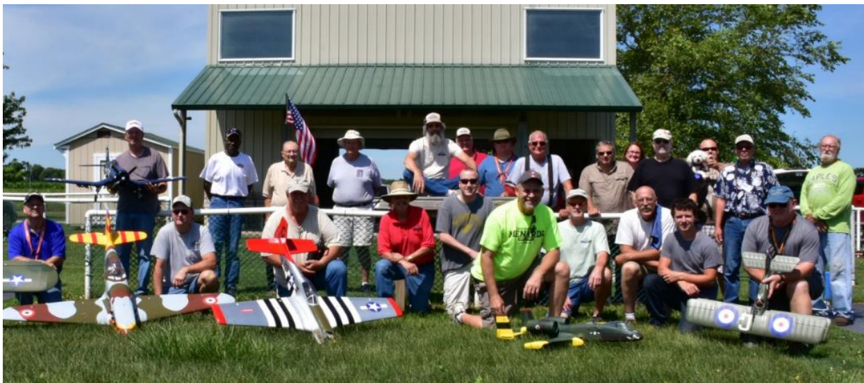
Great attendance at the EPJ Warbird Fun Fly!