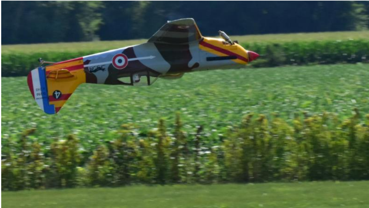
(Pilot unknown)